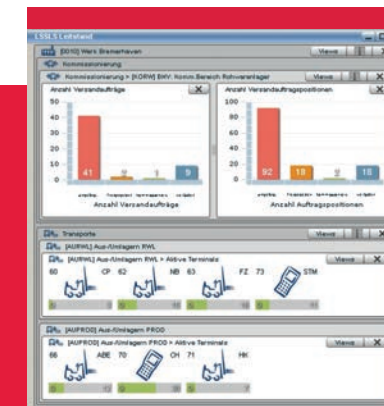
Utilization of the logistics system is visualized in timely fashion. Any deviations from the plan show up immediately and can be corrected.