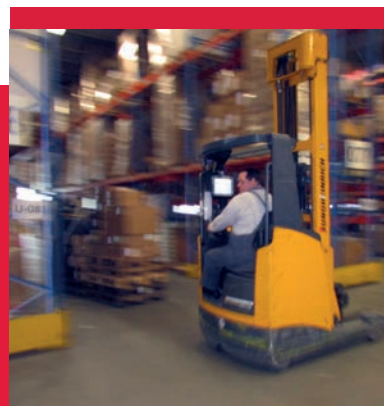
An integrated forklift control system with modern radio terminals reduces distances and optimizes workflows.