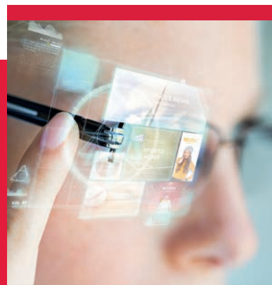
Pick by vision solutions facilitate order picking activities and make sure of more efficient working processes.

Data from operative processes is transferred to a separate warehouse database, where it is available for interactive and dynamic queries. Data from other systems besides ProStore® can also be integrated and queried.