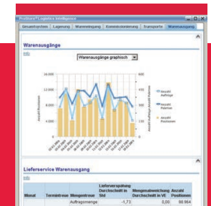
Operating figures provide transparency. The efficiency of the logistics system is displayed at the touch of a button.

Flexibility, modularity and scalability are the crucial factors for successful logistics solutions.