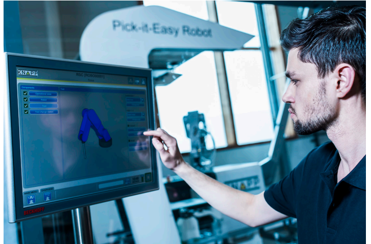
Control centre – work stations – machine control: the unified operating concept easyUse is bringing the very latest human-machine communication to the logistics sector.