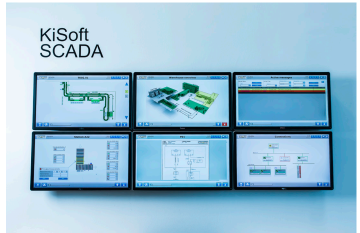
KiSoft SCADA provides a complete overview and transparency across the entire warehouse and ensures maximum availability.