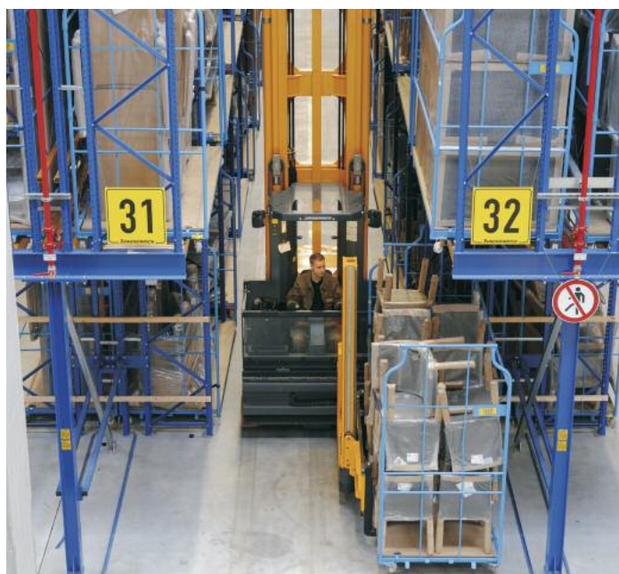
Using the integrated RFID warehouse navigation, the EKX 515 communicates via transponders embedded in the floor

gy, error-free stacking and retrieval is guaranteed." The stacker transmits appropriate confirmations back to the Jungheinrich WMS. The automatic control and monitoring of all processes eliminates other manual and time-consuming scans.