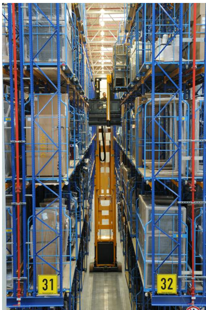
The Jungheinrich EKX 515 electric order picker/tri-lateral stacker operates in the Dedon narrow-aisle warehouse

In the nine aisles of the narrow-aisle warehouse, which has an upper storage height of 12.25 m and is primarily used for C and sometimes for B articles, Dedon uses an inductively guided EKX 515 electric order picker/tri-lateral stacker. Its 80-volt 3-phase AC technology, combined with a load capacity of 1.5 t and the Jungheinrich Personnel Protection System, makes this stacker ideal for very high throughput rates. Using the integrated RFID warehouse navigation, the EKX 515 communicates both via transponders embedded in the floor measuring continually its route, and the Jungheinrich WMS, which issues jobs to the truck via radio data transmission. The operator scans the barcode on the Furni-Box, receives the coordinates of the destination bay from the Jungheinrich WMS and starts to travel to this location. Stefan Zander: "As the stacker automatically takes the shortest route to its destination, at the highest possible speed and with the lowest consumption of ener-