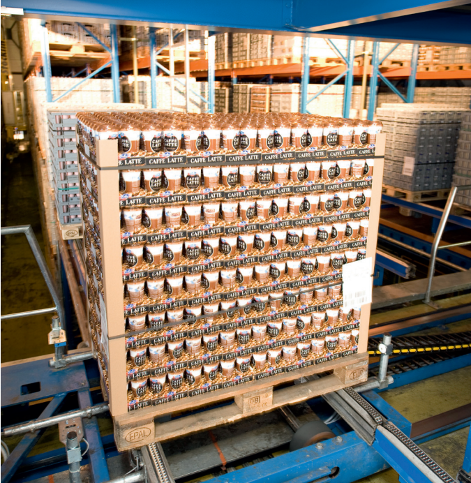
The warehouse management system inonsoWMS X first went live in 2014 at the site Ostermundigen near Bern

software landscape, which it realized in multiple steps at 22 sites from 2014 to 2016.