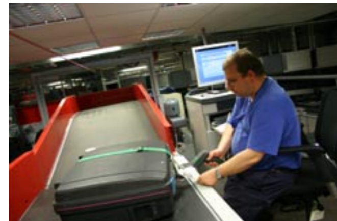
Efficient no-read processing. A further module in the PSIairport product suite

100% availability and continuous improvement process. PSI Logistics remains at the users' disposal even after successful installation, with all kinds of services. Trained maintenance and on-call staff react quickly and competently to customer requests, round the clock if required.