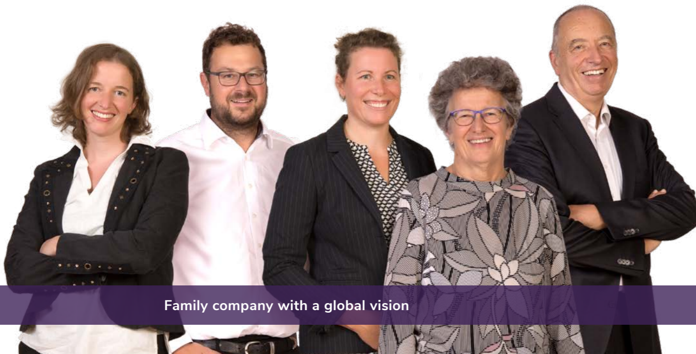
Family company with a global vision

This has been CIM's vision for over 30 years at the forefront of the warehouse management sector. As an ISO-certified full-service partner for warehouse management systems, we supply hardware and software packages tailored to your needs. Our eye for detail is our hallmark. Each of our 80 employees is a specialist in their field and makes a valuable contribution to CIM's global success. We see each project as a new and exciting challenge. Efficient material flows and optimised processes are our drivers, constructive solutions are our goal. The numbers speak for themselves – our software has 10,000 satisfied users across the globe.